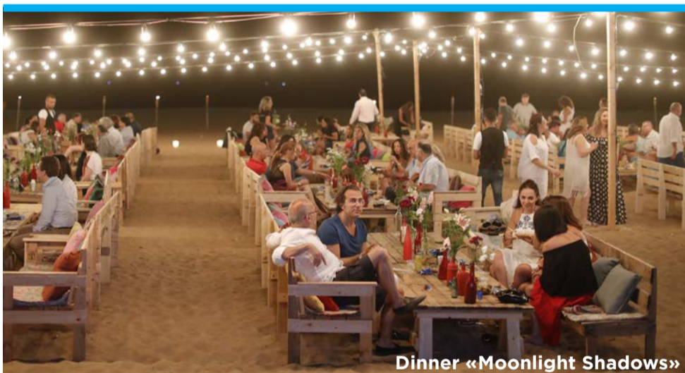
Dinner «Moonlight Shadows»

SESOBEL organized 12 self-financing activities thanks to the efforts of all our support committees and the Marketing team.